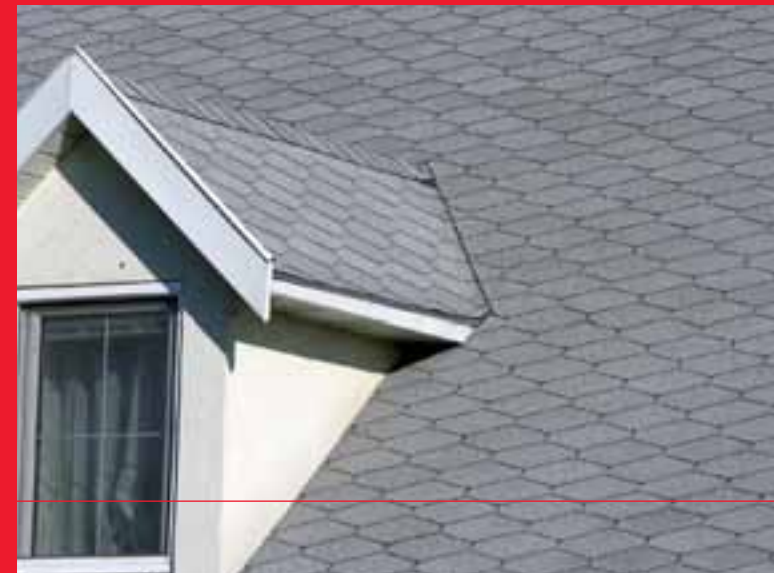
Park Molenheide - Belgium